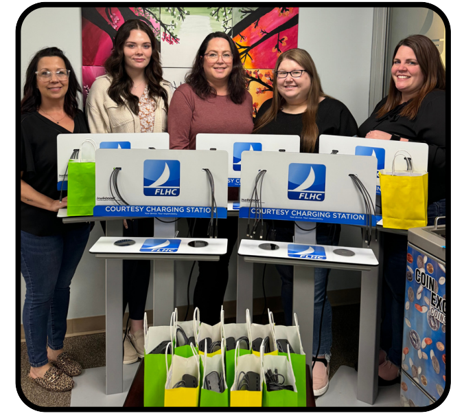
Earlier this year, FLHC FCU donated more than a dozen charging stations to Arnot Health. They can be used by staff and patients at several locations on and off the main campus.

We also set up a table outside of new hire orientations, located outside of the Petrie Rooms in AOMC. Stop by for free gifts or refer your Arnot Health co-workers or your family members to stop by and get information about joining the Credit Union.